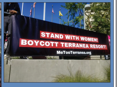
Local politics on display during the march checkout their website, <u>metooterranea.org</u>/, to learn how you can stand with the "Terranea Silence Breakers"