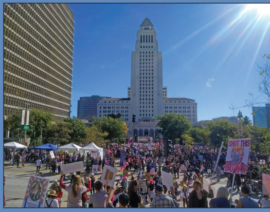
City Hall - reportedly over 200,000 people marched from Pershing Square to City; Mayor Eric Garcetti stepped out of the Teacher's Strike negotiations to address the crowd